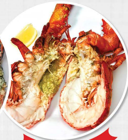
Steamed Pure and simple