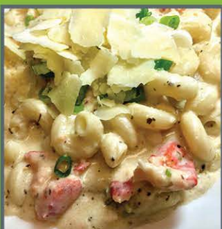
Lobster Mac & Cheese