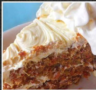
Karat Cake (Made in-house)