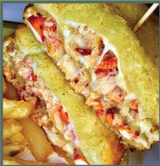
Lobster Grilled Cheese