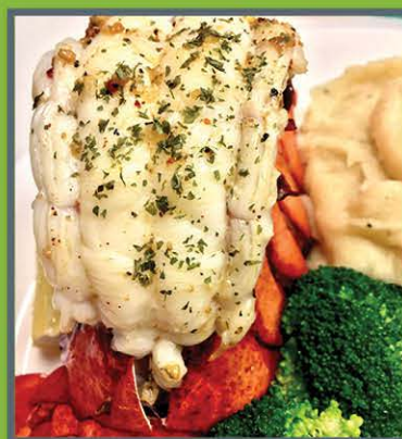
Single Lobster Tail Dinner