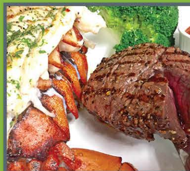
Surf and Turf