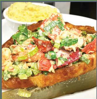
Cold Lobster Croissant Roll