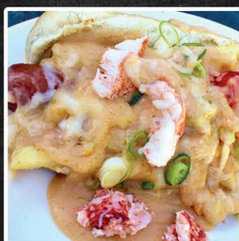
Lobster Poutine Dog