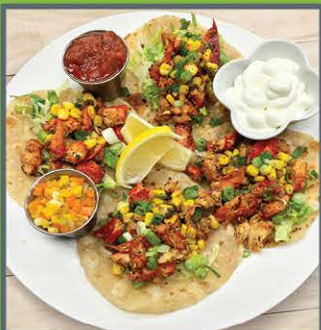
Lobster Tacos (sharing size)