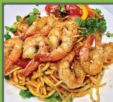
Grilled Shrimp Pasta