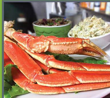
Steamed Snow Crab Legs