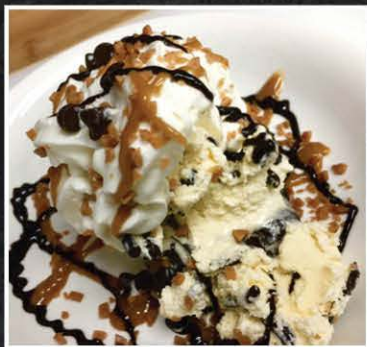
Brownie Mountain Crackle