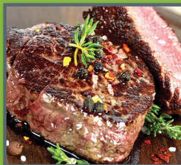
The Monster Prime Filet Mignon

Colourful medley of grilled vegetables wrapped in a soft spinach tortilla. Served with a choice of side. Add: Cheddar or Mozzarella Cheese $2