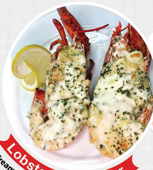
Lobster Thermidor Creamy sauce topped with melted cheese