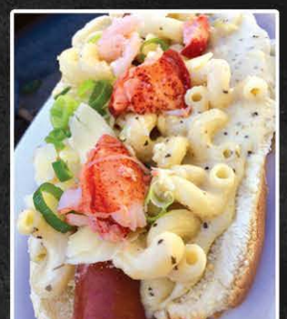
Lobster Mac'n Cheese Dog

FANCY DOGS $8 With Lobster: Add $4 Poutine Dog or Mac'n Cheese Dog